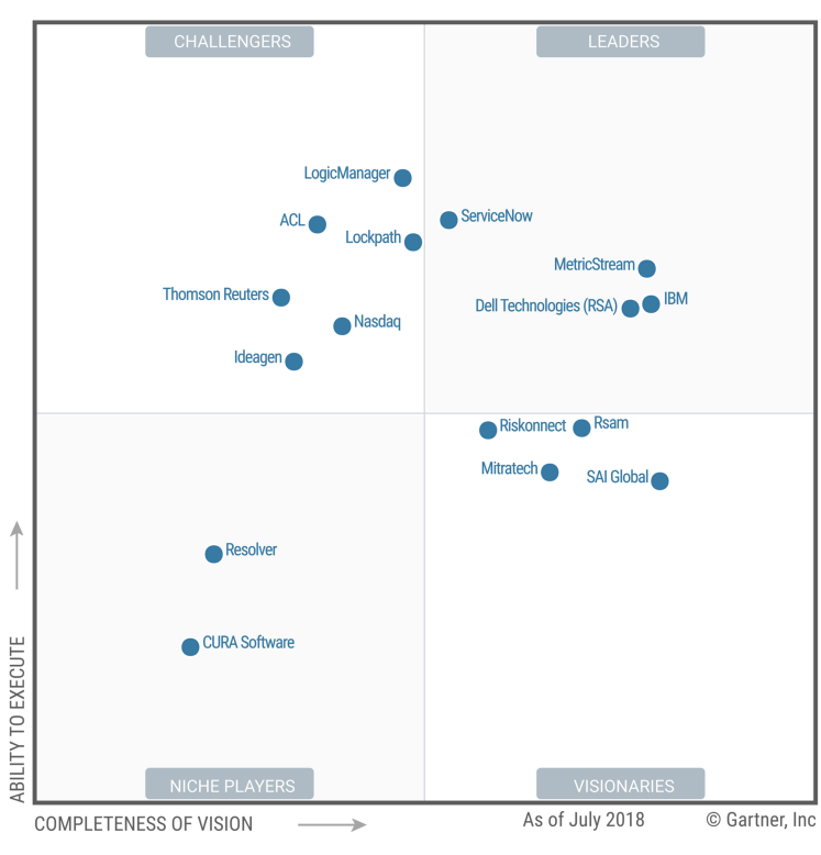
Figure 1. Magic Quadrant for Integrated Risk Management